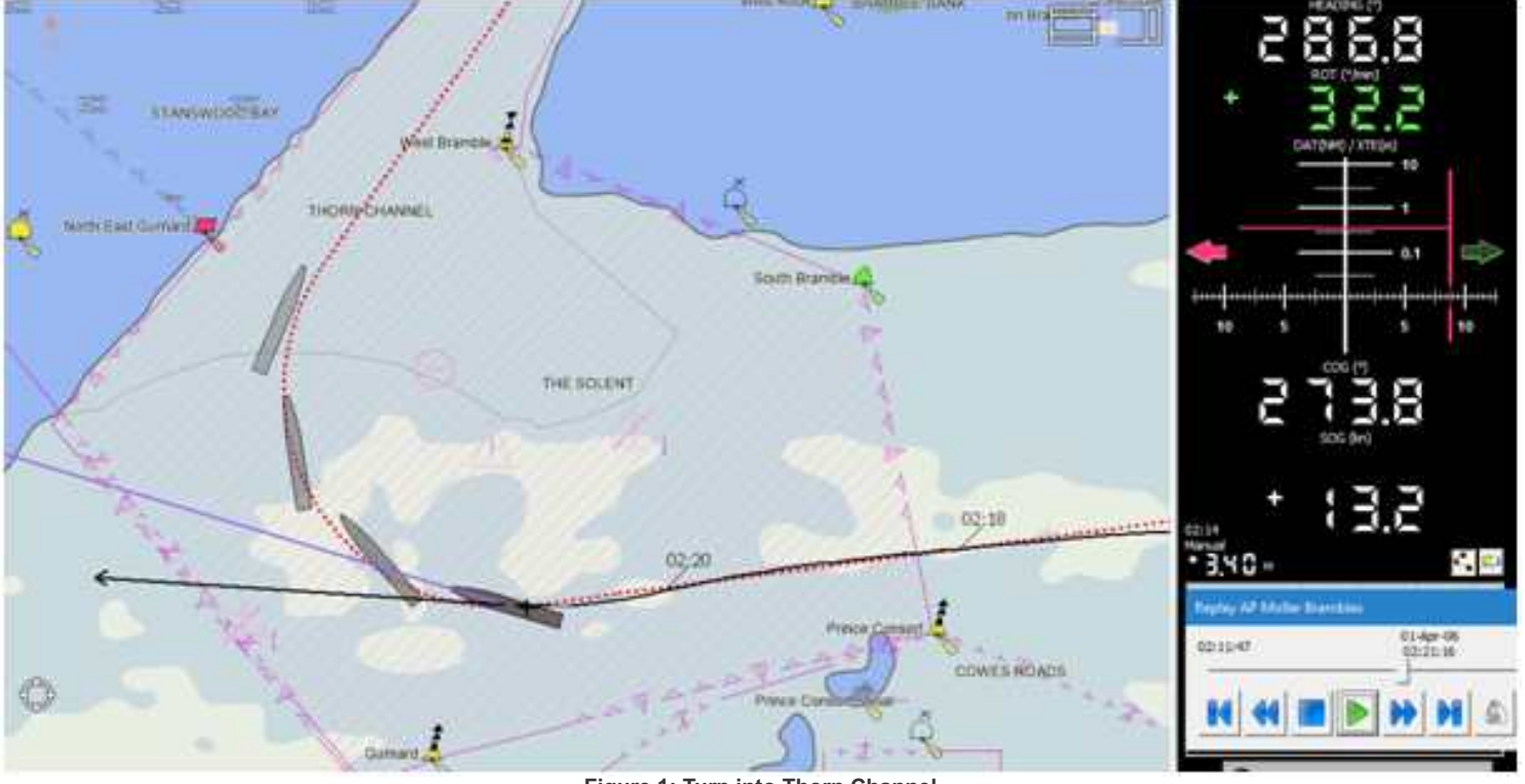
Figure 1: Turn into Thorn Channel

Unfortunately, even with a common plan and a shared mental model, it is all too common for the pilot to receive very limited support from the rest of the bridge team. Consequently pilots become potentially a single point of failure and need to maximise their own ability to monitor